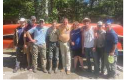
The BWCA Campers and Guides

We left the boundary waters camp in great condition because we picked