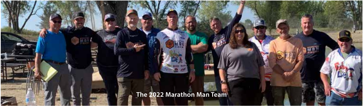
The 2022 Marathon Man Team