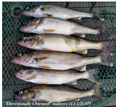
"Directionally Oriented" walleyes (15 1/2-19")

When I started moving again and over a half a MPH, then the walleyes started biting again. I guess they just wanted their dinner to be moving and in one direction!