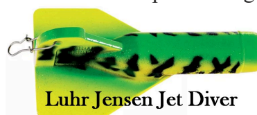
Luhr Jensen Jet Diver

There are other options for getting down deep: Of