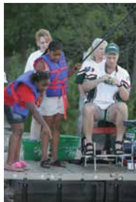
The early days of Marathon Man

athon Man event in Florida but we had to decline. We did not know why God was holding us back? We loved it, wanted it and seemingly, needed it.