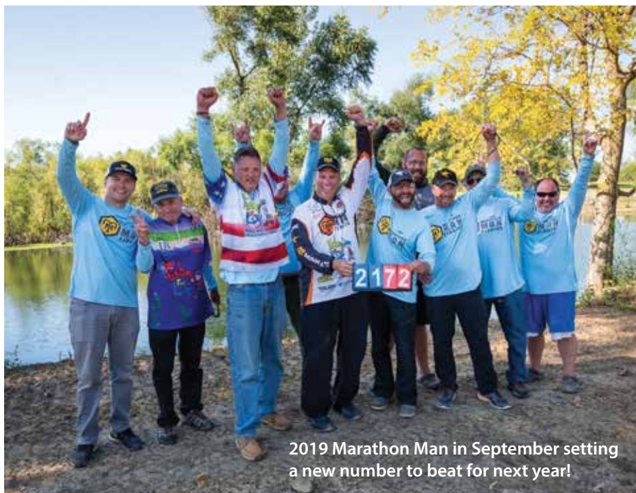
2019 Marathon Man in September setting a new number to beat for next year!